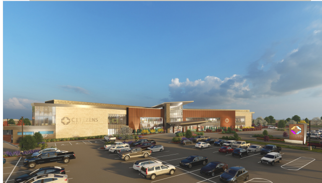
NW to SE View